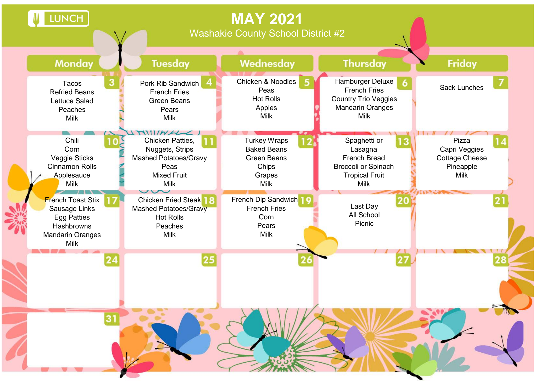
This Institution is an Equal Opportunity Employer