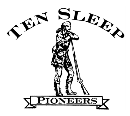
Ten Sleep School Supporting Success

Phone: 307-366-2223 Fax: 307-366-2304 www.wsh2.k12.wy.us: